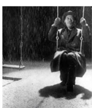
Minu by Akira Kurosawa